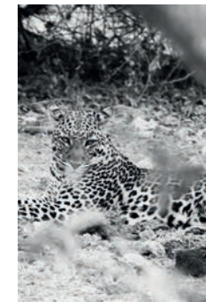
Africa Chobe Nationalpark Leopard, 2012 Page 29