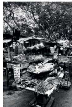
Thailand Bangkok Streetfood 2020 Page 17