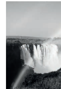
Africa Simbabwe Victoria Falls, 2012 Page 32-33