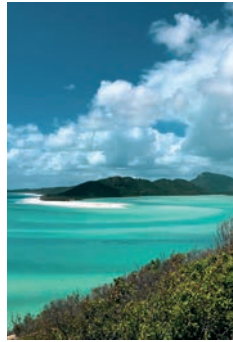
Australia Whitsunday Islands, 2018 Page 12