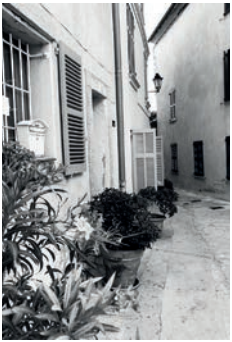
France St. Tropez Old Town 2019 Page 34