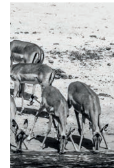
Africa Chobe Nationalpark Antelope 2012 Page 29