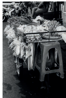
Thailand Bangkok Streetfood 2020 Page 16