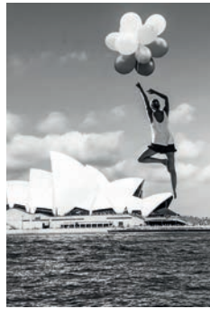
Australia Sydney Opera House 2018 Page 4-5