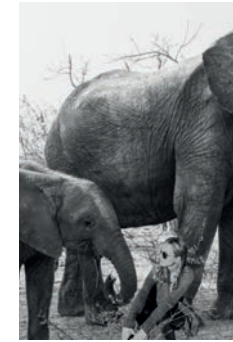
Africa Chobe Nationalpark Elephants 2012 Page 26-27