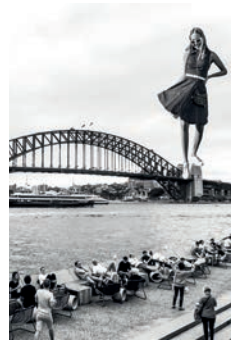
Australia Sydney Harbour Bridge 2018 Page 8-9