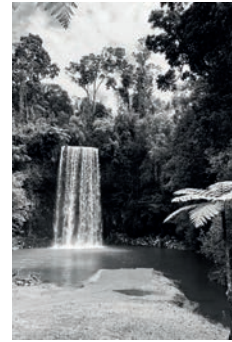
Australia Cairns Milla Milla Falls, 2018 Page 13