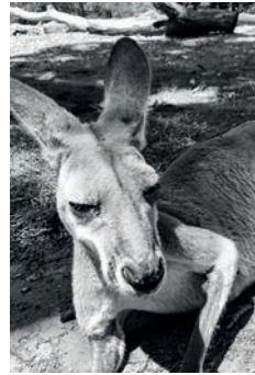
Australia Brisbane Kangaroo, 2018 Page 12