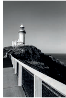
Australia Byron Beach Lighthouse 2018 Page 13