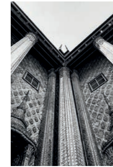
Thailand Bangkok Temple of the Emerald Buddah, 2020 Page 20