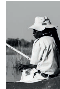
Africa Chobe Nationalpark Our Guide 2012 Page 30-31