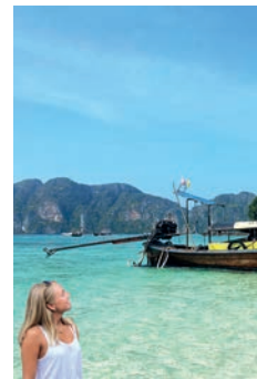
Thailand Koh Phi Phi 2020 Page 18-19