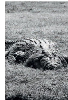
Africa Chobe Nationalpark Crocodile 2012 Page 29