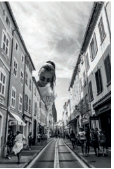
France St. Tropez Old Town 2019 Page 36