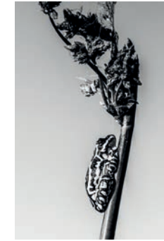
Africa Chobe Nationalpark Frog, 2012 Page 28