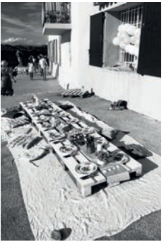
France St. Tropez Old Town 2019 Page 34