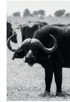
Africa Chobe Nationalpark Buffalo, 2012 Page 28