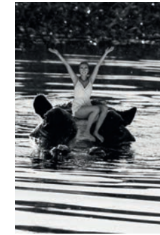
Africa Chobe Nationalpark Hippo, 2012 Page 22-23