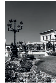
Thailand Bangkok Grand palace 2020 Page 20