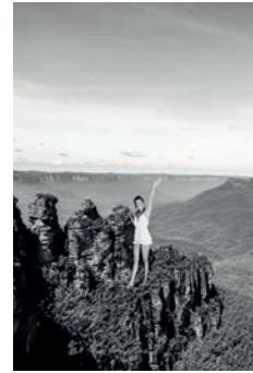
Australia Sydney Three Sisters Blue Mountains 2018, Page 10-11