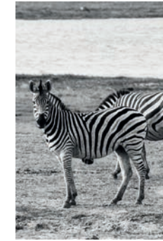
Africa Chobe Nationalpark Zebra, 2012 Page 28