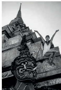
Thailand Bangkok Temple of the Emerald Buddah, 2020 Page 15