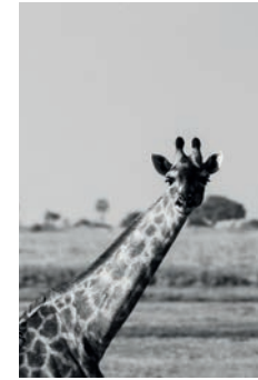
Africa Chobe Nationalpark Giraffe, 2012 Page 24-25