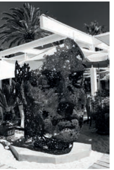
France St. Tropez Beach, 2019 Page 37