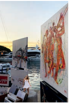
France St. Tropez Harbour, 2019 Page 35