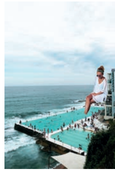
Australia Sydney Bondi Beach 2018 Page 7