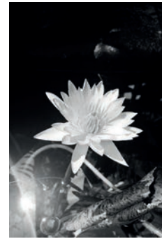
Australia Sydney Botanical Garden 2018 Page 12