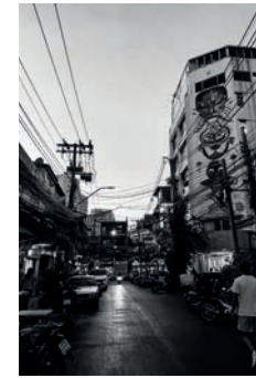
Thailand Bangkok City, 2020 Page 20