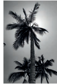
Australia Cairns Palms, 2018 Page 13