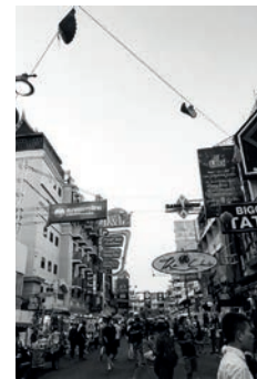
Thailand Bangkok City, 2020 Page 20