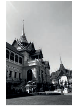
Thailand Bangkok Grand palace 2020 Page 21